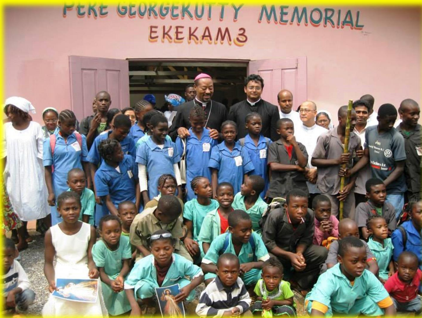
Our sponsored children in Chad