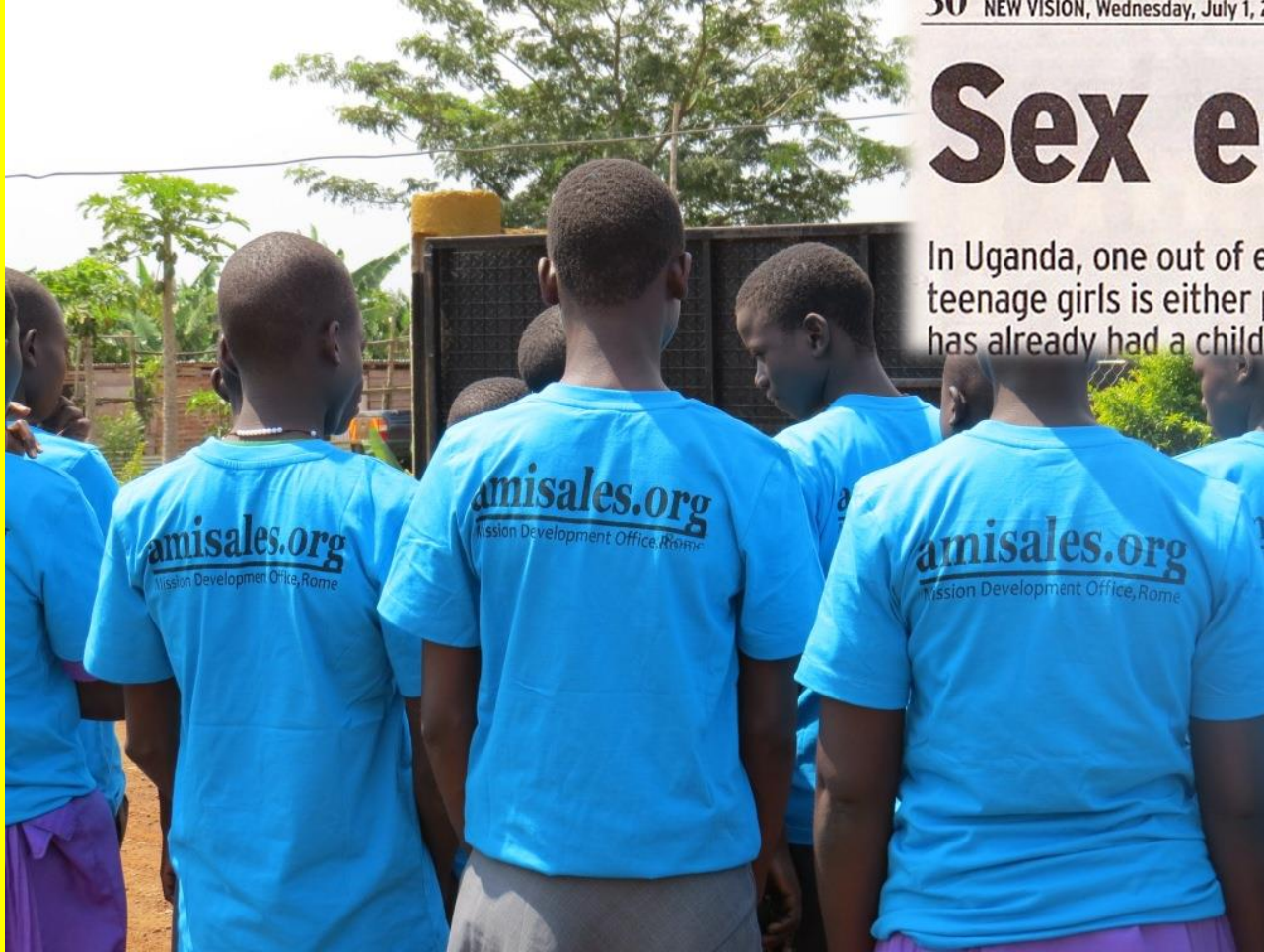
Our supported young girls in Uganda