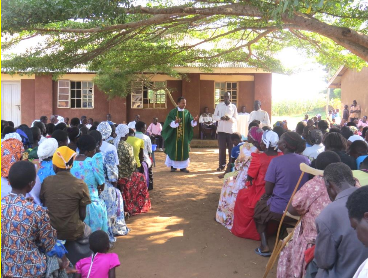
Holy Mass under the Tree with 700 People

Missionaries of St. Francis de Sales (Fransalians)