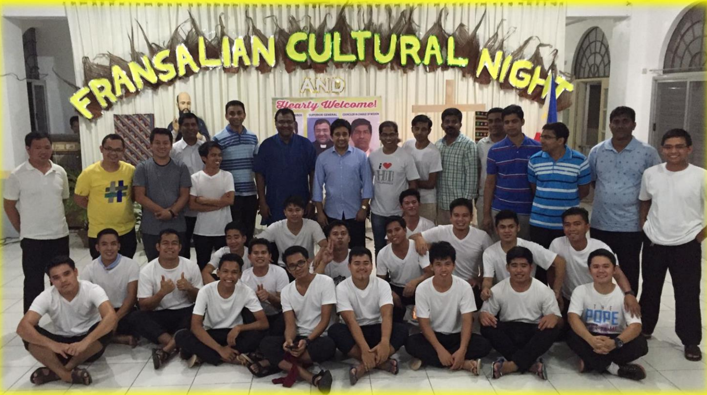
Our Seminarians in Philippines