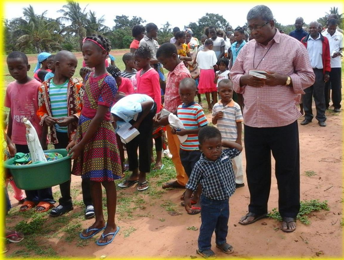
Our Education Project in Mozambique