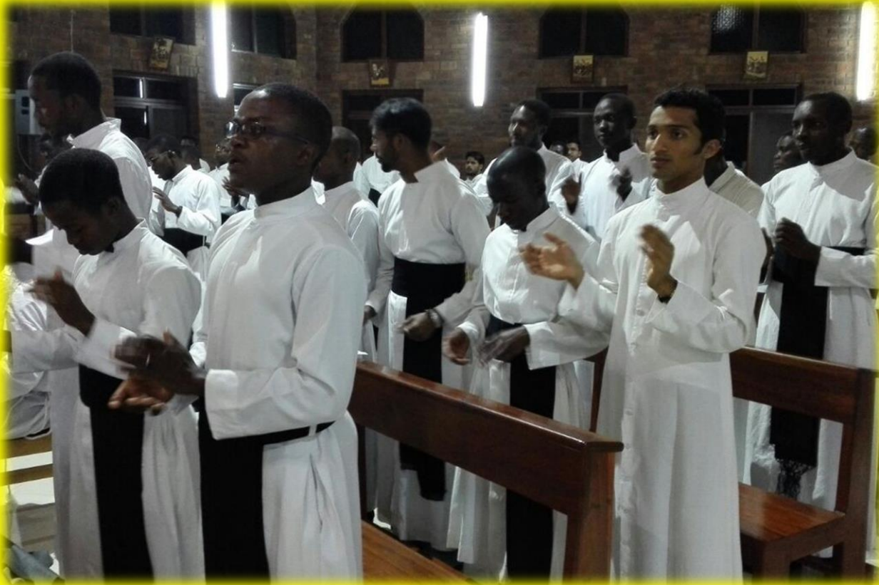
Our Seminarians in Arusha , Tanzania